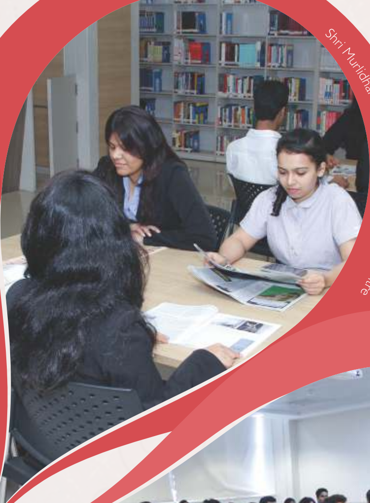
Shri Murlidhar Karwa Knowledge Resource Centre