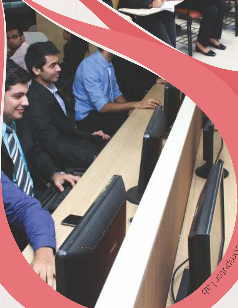
Beniprasad Luharuka Computer Lab