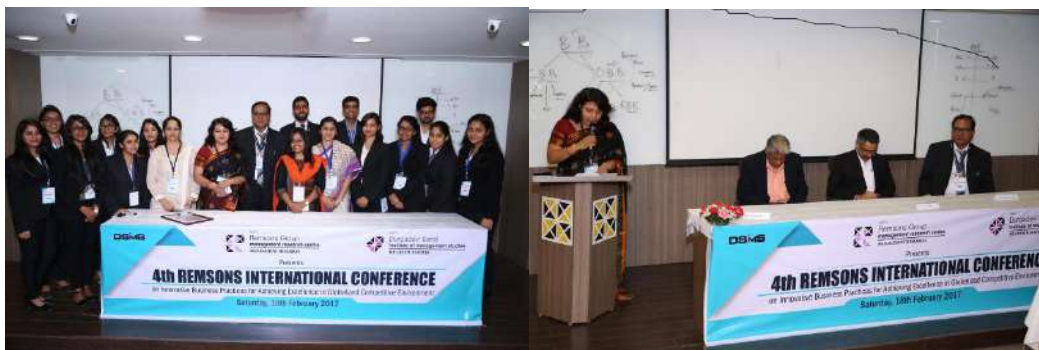
4 th Remsons International Conference held on 18 th February, 2017.

A unique endeavor on the part of the Institute to host a conference on Innovative Business Practices as one of the most critical strategic dimensions of Indian growth trajectories in times of uncertainty. The Conference was indeed a grand success.