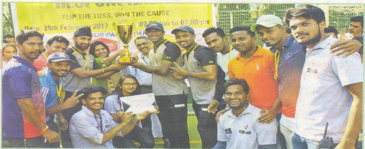
Winners bask in the glory

plemented by ISKCON Food Relief Foundation, this programme benefits schools across seven states and 1.2 million meals are served every day to children through ISO certified hi-tech kitchens.