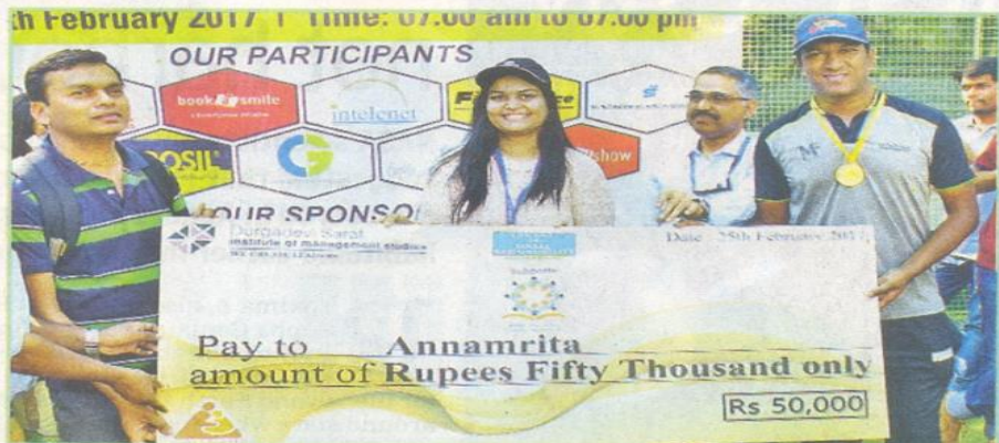
Donating for a better future

D urgadevi Saraf Institute of Management, Malad (W) recently organised an event called 'Cricket for Social Responsibility'. Kotak Mahindra Bank, Book My Show, Book A Smile, Intelenet, Crompton Greaves, Mahindra First Choice, Borosil, Carnival, Sundaram Business Service and Jyothi Laboratories participated in the one-day fund raising initiative for Annamrita, an NGO that provides free mid-day meals to students in municipal and government aided schools. Im-