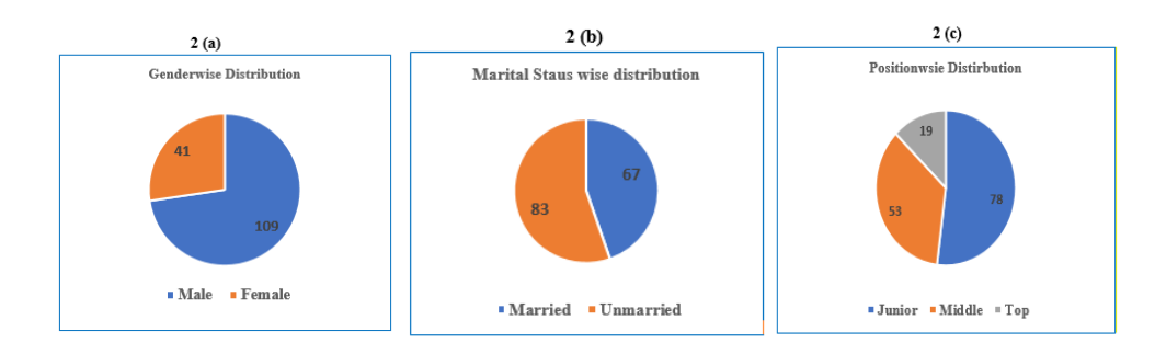
Figure 2 (a, b and c) represents the gender, marital status and position wise distribution of the sample under study.

The reliability of the measures indicates the extent to which it is without bias or error free and hence ensures consistent measurement across time and across various items in the instrument. In other words, reliability of a measure is an indication of stability and consistency with which the instrument measures the concept and helps to assess the "goodness" of a measure. Table 2 shows the reliability of the three variables.